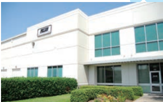
Nippon Pillar Corporation of America